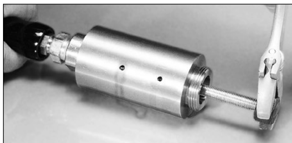
Relieving the pressure on the hose half of a coupler.