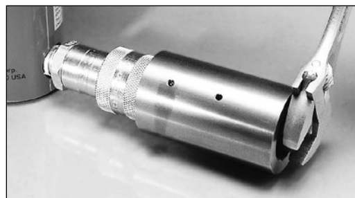
Relieving the pressure on the ram half of a coupler.

NOTE: This Power Team tool is designed to specifications identical to the tools in use in our factory and is covered by our lifetime warranty in regard to factory defects. However, because of the nature of the application, wear and breakage specifically are excluded. Follow this instruction sheet closely to maximize the tool life.