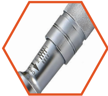
Easy lock and Adjust