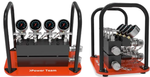
LM4D - Double Acting Pictured Above