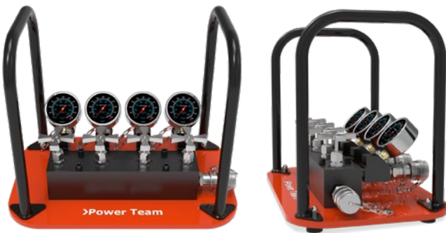
LM4S - Single Acting Pictured Above

* -E models contain CE/UKCA compliant gauges