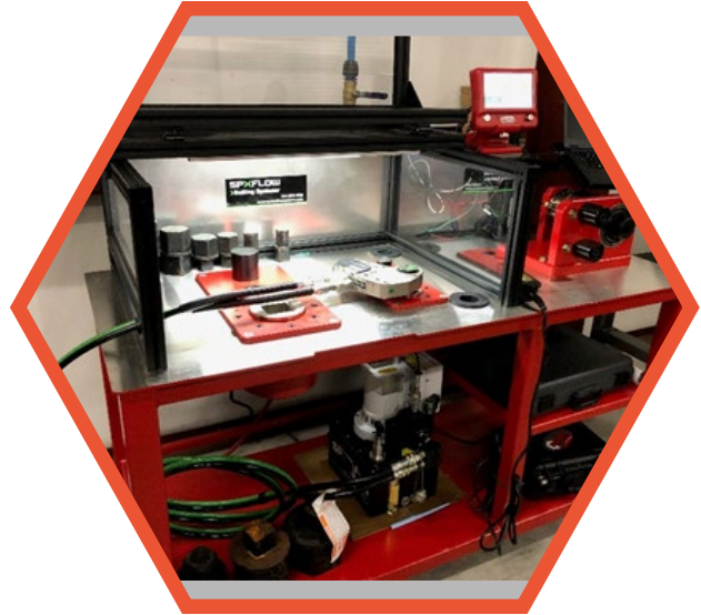
Torque Wrench calibration

What sets us apart is our ability to calibrate wrenches up to an impressive 55,000 ft-lbs of torque—something only a handful of companies in the industry can achieve. This makes HT Bolting Systems your trusted partner for all your bolting equipment needs, whether for rentals or customer-owned tooling.